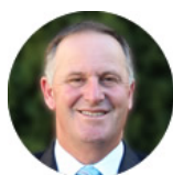
Rt Hon Sir John Key, GNZM AC